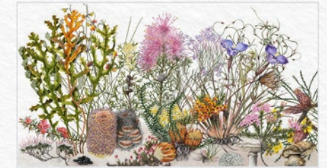
Banksia Coneflower and Fungi