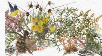
Banksia Bush-Rat and Parrots