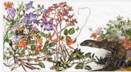
Heath Monitor and Hibiscus