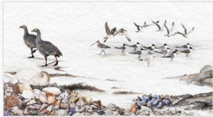
Cape Barren Geese and Paper Nautilus