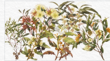
Eucalyptus and Spinebill