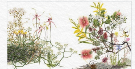
Inland Rock Gardens

PRINTS AVAILABLE FOR PURCHASE FROM $385 UNFRAMED AND $715 FRAMED VISIT SHOP.STATEBUILDINGS.COM