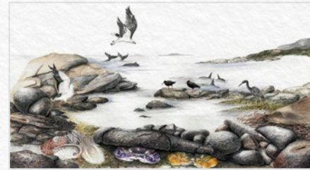
Rockpool with Crabs and Seal