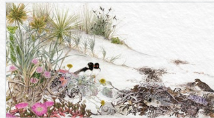
Sand Dune and Plovers